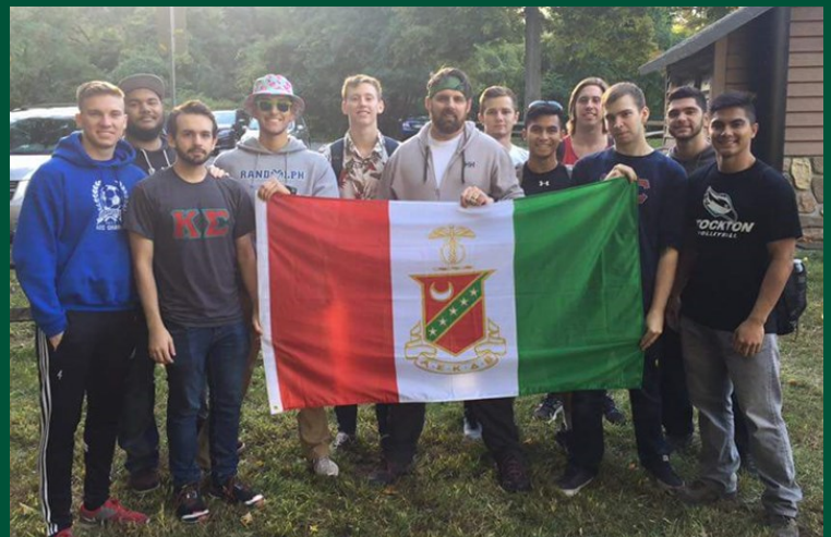
Top, Bottom Right: A few of our brothers hiking the beautiful Mt. Tammany