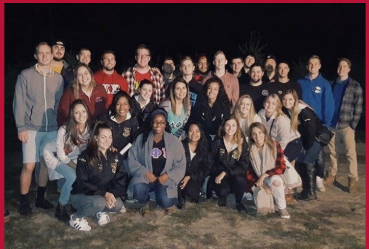
Left: Our Brothers with the Sisters of Zeta Tau Alpha at the Cape May Zoo donating toys for the animals