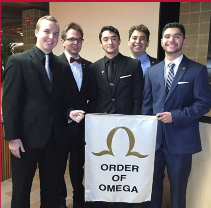
A few of our Brothers being inducted into Order of Omega, the Honor Society for Greek Life

We continue to strive to have the highest GPA on campus and we accomplish this by having motivated brothers and a great system!